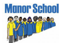
Manor School North London