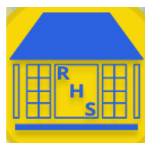
Russet House School North London