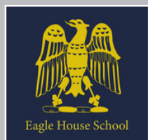
Eagle House School North London