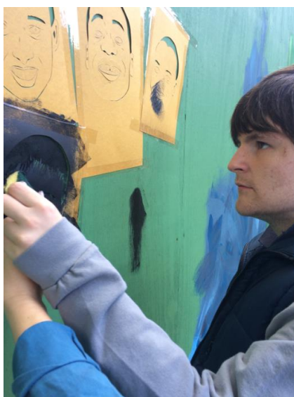
As part of the Arts Award, Q6 have been working on a mural project in their garden. They brightened it up with lots of colourful, floral design!