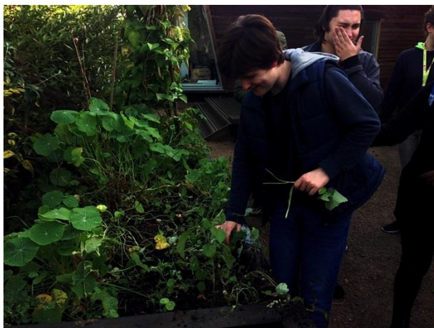
As well as community visits, Q6 are also involved in the work experience at Hyde Park, filling bird feeders and planting beans.